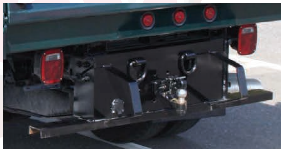
Pintle and Receiver Hitch Plates