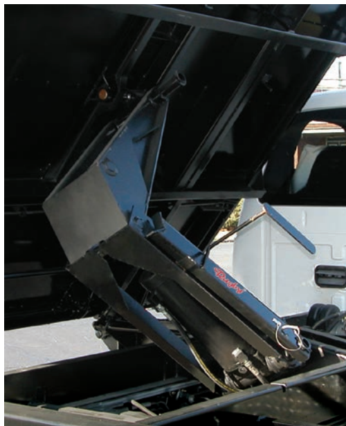
Multi-Directional dumping hoist specifically designed for the Eliminator MD body.

Dumping direction is easily controlled with one lever and Rugby's standard tailgate release controls both the rear and the side release. The Eliminator MD includes Rugby's patented EZ-LATCH™. Standard vertical side and tailgate braces along with the Eliminator's sleek design offer the complete package to make your work truck stand out!