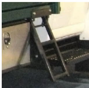
Two Rung Ladder